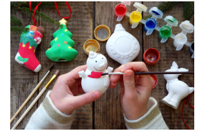
Crafting Christmas Ornaments